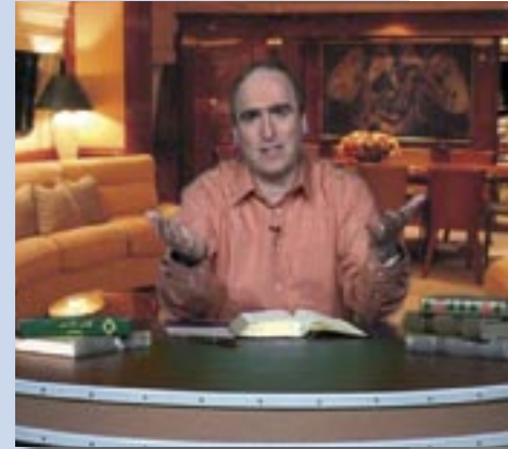
Above: Presenter of the ‘New Wine, New Wineskins’ program

New Wineskins”, which covers a number of topics, including obedience. Iran is a nation with a high percentage of teenagers and young adults, and youth anywhere can become rebellious. The host of “New Wineskins” often looks directly into the camera and speaks to viewers like this: “I’m talking to you my friends, young men and women. God loves you and he wants you to obey this way, you are God’s child.” The host goes on to describe many verses about obedience, including obedience to God, parents, elders, and government officials. The host presents these lessons in such a natural and approachable way that even one PARS counselor admits, “I really like this show. I’ve learned a lot about the Bible through it.”