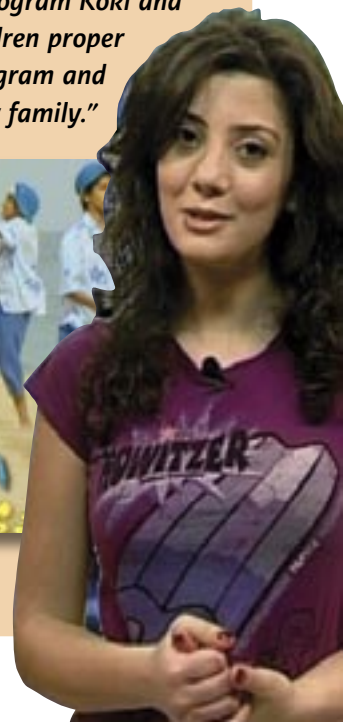
Right: Presenter of the ‘Top Ten’ program