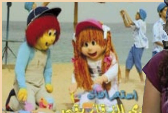
Above: Characters on location in Egypt

bags of dead fish. “That smells! Why do you have those?” asks a Koki. Atat’at says he’s hoping he can find a gold ring inside one. During a Bible study segment, Atat’at hears the story of when Jesus told Peter to catch a fish, and that inside would be a coin needed to pay his taxes (Matt. 17:27). The lesson of the story is that it is important to follow the rules and be obedient. Later Atat’at makes a joke that he should have looked in the fishes’ mouths instead of their stomachs! While the show is designed to make children laugh, it is also effective. One mother in Egypt recently wrote, “I would like to send special greetings to the program Koki and Atat’at. The program teaches my children proper behavior. I am so thankful for the program and I really consider it important for every family.”