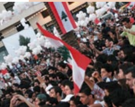
Above: Lebanese celebrate the election of a new president