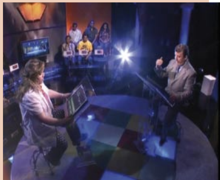
Above: 'The Answer Is In The Book' gameshow

"Would you like to win a new laptop computer, or mobile phone?" Those are two of the prizes in a new SAT-7 game show for adults called, "The Answer is in the Book." In this new show, contestants will be quizzed on their knowledge of God's Word, with the opportunity to win nice prizes. The program's producers believe it will not only stimulate viewers to learn more about the Bible but will also be a lot of fun as viewers experience the stress the contestants feel as they try to think of the right answers. "The Answer is in the Book" is currently in production and, when it airs sometime later in the year, producers believe it will attract many new viewers to the channel.