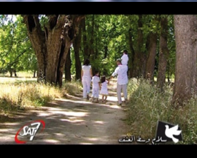
Campaign logo and screen shots from TV spots