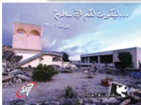
Above: Screen shots from TV spot from the 'Peace Amidst Violence' campaign Right: A scene from 'How are you with Christ?'