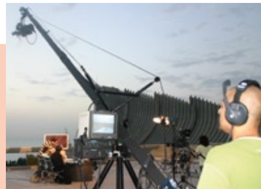
Live outside broadcast of Nafitha

Nafitha (Windows) is SAT-7's long running current affairs and news program. Originally broadcast in 1998, its purpose has been to bring reports of what the Lord is doing around the world to the Christians of the Middle East, helping them to feel a greater connection to Christ's global family. Over the years the program has grown significantly and is now two separate shows: " Nafitha Around the World " continues to bring reports about Christian activities around the world to an Arabic speaking audience, and " Nafitha Live " is an interactive current affairs program that has been